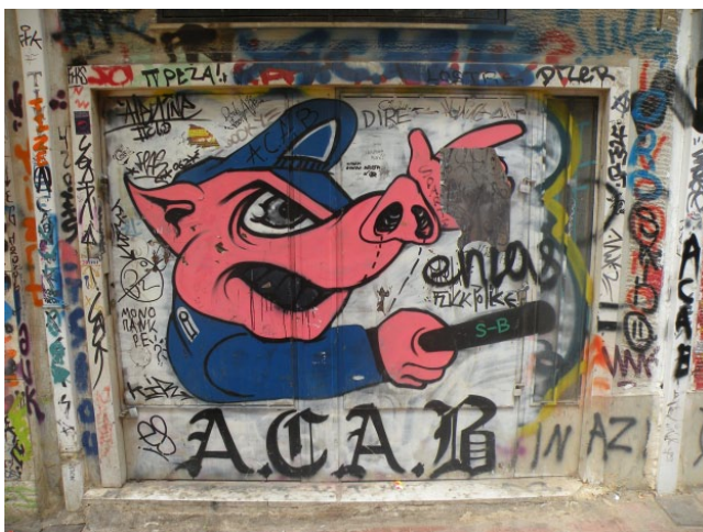
Figure 2. A mural, within a constellation of slogan and tags, depicts a riot police officer as a pig holding truncheons accompanied by the acronym ACAB (All cops are bastards).