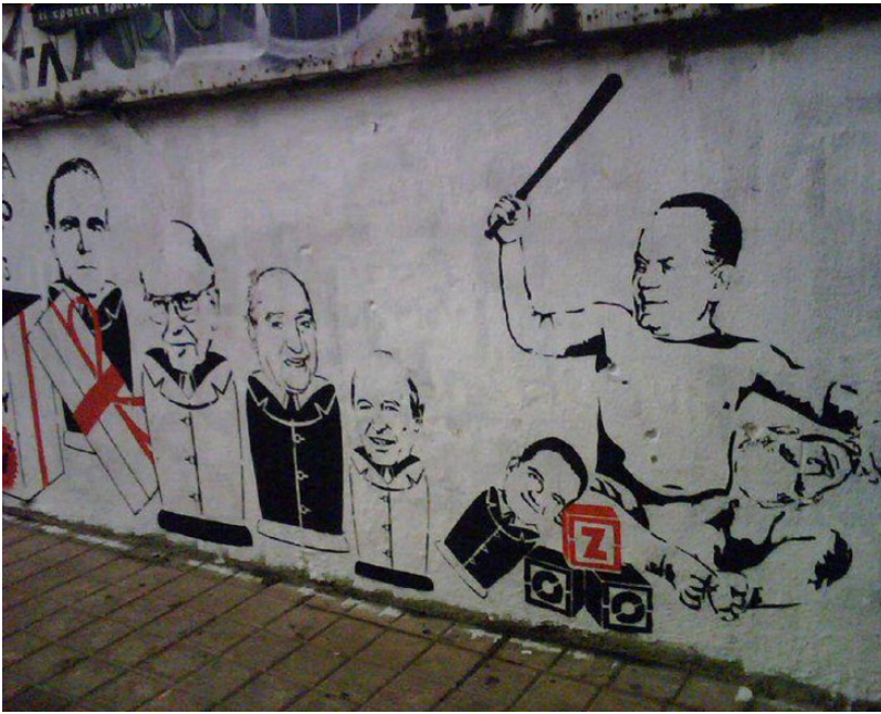
Figure 5. A stencil by Political Zoo crew portrays the spirit of state authoritarianism and the crisis of post-dictatorship leadership in modern Greece.

consumerism. It follows the figure of Costas Karamanlis (nephew of the former) who ran the country before the first memorandum era, leading it close to bankruptcy. He rests his hand on the right knee of the dictator Georgios Papadopoulos of the Junta of Colonels (1967–1974). The latter clasps a truncheon and holds under his left arm in a stranglehold the head of Georgios Papandreou, the prime minister of Greece who led the country to the vicious circles of memoranda. Under the feet of the dictator are stepping-stones where the letters Z-O-O are formed, referring to the Political Zoo Crew (see Figure 5).