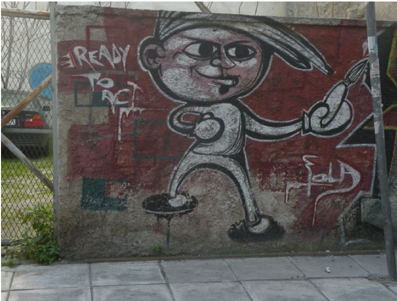
Figure 6. A graffiti depicting an unusual monstrous figure underlines the importance of effective political struggle beyond the limitation of ordinary society.

with earlier traditions of rebellions, mobilizing support for their political goals (Damianakos, 1987; Zaimakis, 2010: 12). In the same vein, in Exarchia a mural depicts a cartoon character holding a small Molotov cocktail with a caption inciting people to rebellion: 'Ready to act' (see Figure 6). These forms of graffiti seem to follow an international visual discourse concerning figures of rebels, evident for example in the widespread stencil of a masked Zapatista rebel and in the figure of Sandino, a rebel hero in the 1920s and 1930s, in the murals of Sandinistas in Nicaragua.