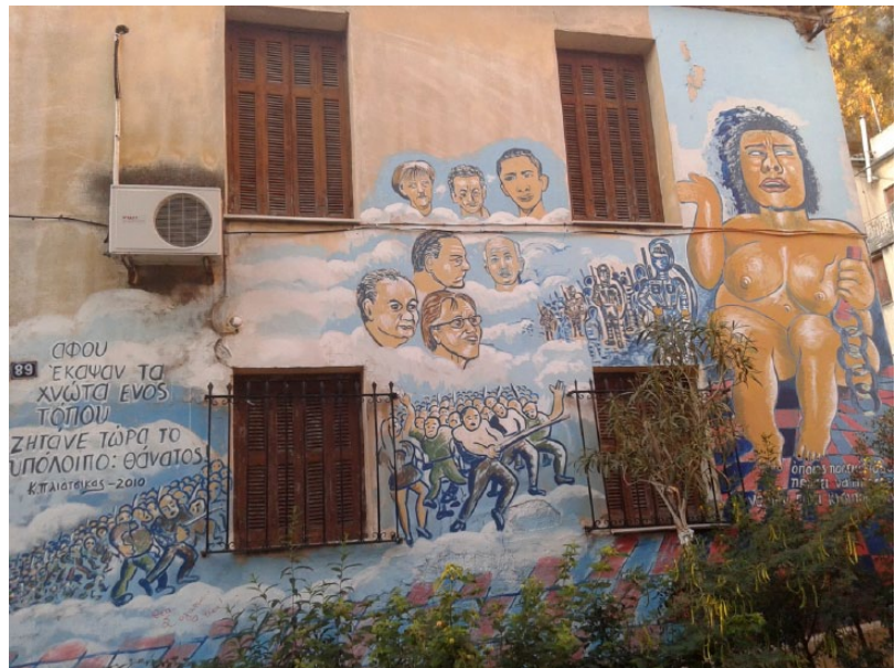
Figure 4. A mural by Costas Pliatsikas pictures a political struggle between oppressed people and the mechanisms of state repression, containing two political commentaries on people resistance to neoliberal policies of crisis management and on fair social fights.

politicized space reveals the spatial politics of the graffiti artists signifying both the involvement of the actors, coming from leftist and anarchist camps, in a vivid dialogue with the voices of other writers and passers-by and their spatial conquest of the landscape.