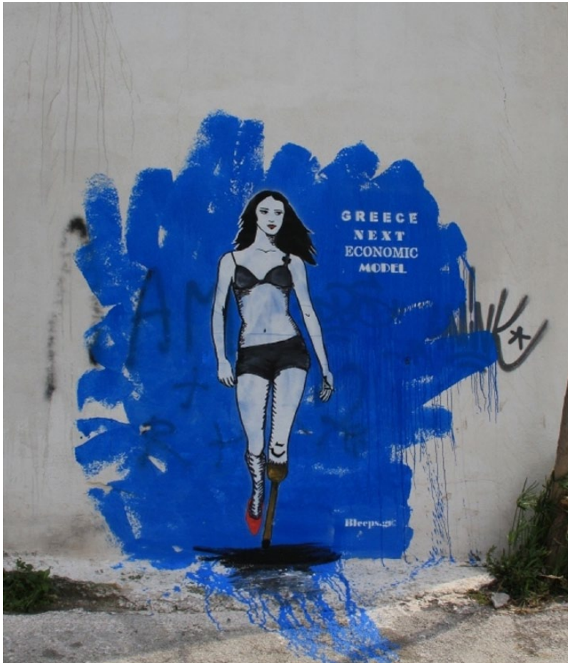
Figure 1. A graffiti piece by Bleeps presents Greece as a top-model with an amputated leg.

a 'zero tolerance' policy. This was a temporal point in the spatial politics of graffiti artists who produce counter-spaces in central roads and squares associated with mass demonstrations commenting on the political climate of time. In inner city areas, the sense of fear and insecurity in the city is illustrated in several murals, presenting variations of images of police officers depicted as pigs holding truncheons (see Figure 2) or images of tear-gassed protesters wearing protective masks. Writers employ iconic figures to represent the gloomy conditions of a society in crisis and to express artistically their sense of fear, uncertainty and precariousness. One striking example of this type of street art is a piece by Sidron, an Athenian cultural activist, depicting a protester wearing a full-face gas mask accompanied by a slogan reading 'Welcome to the civilization of fear'. The graffiti is an intriguing reminder of the violent tensions, pollution, and risk of those who feel excluded from bearable urban social life (see Figure 3).