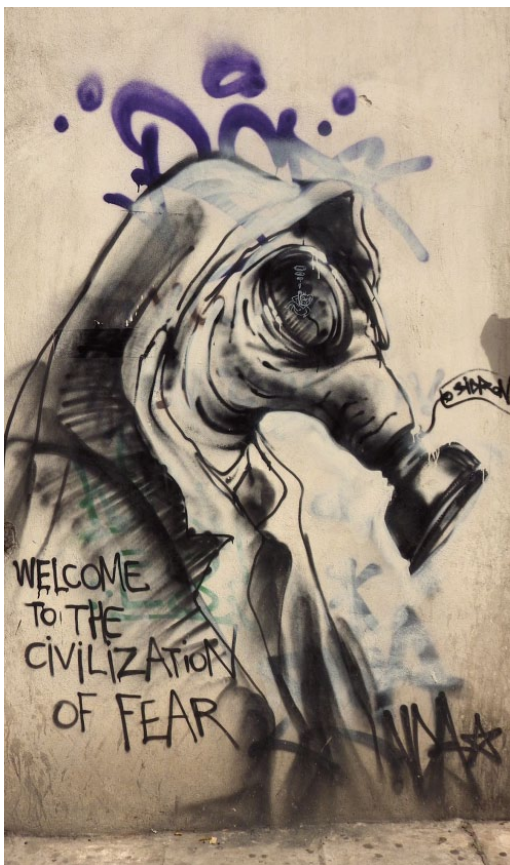
Figure 3. A piece by Sidron depicts a protester wearing a gas mask associated with a social commentary on the climate of uncertainty, risk and pollution of everyday life in Athens.