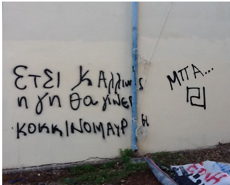
Figure 8. A slogan inspired by left-wing, revolutionary poetry and right next to it a negative verbal response accompanied by the symbol of Golden Dawn.

infiltrate everyday life, extending their ideological influence into the spatial environment and challenging the longstanding cultural hegemony of leftist or anarchist political graffiti in the urban landscapes.