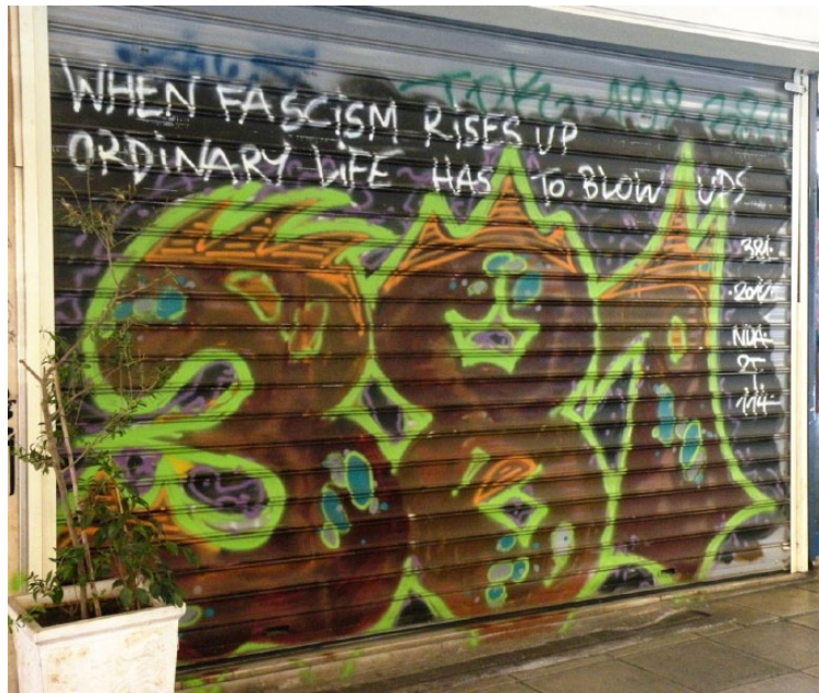
Figure 7. A mural incites people to make a determined stand against fascism.